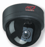
( \phi 120, 3Axis)