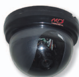
( \phi 100, 3Axis)