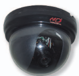
( \varnothing 100, 3Axis)